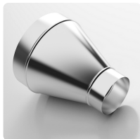
Hose Reducer, symmetrical Hose reducer for extending, connecting and joining light to medium weight hoses