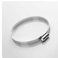
Hose Clamp with Worm-Gear Standard clamp for fastening light hose types to connecting pieces on mobile and stationary installations