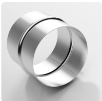
Hose connector Sheet steel connector for extending, connecting and joining light to medium-weight hoses