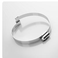
Master-Grip Hose Clamp, screwable Special clamp for fastening light and medium-weight, right-handed spiral hoses such as Flamex B-se, Flamex B-F se, Master-PUR Trivolution, Master-PVC and Master-SANTO